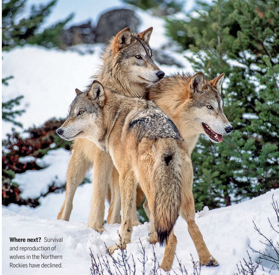
Where next? Survival and reproduction of wolves in the Northern Rockies have declined.